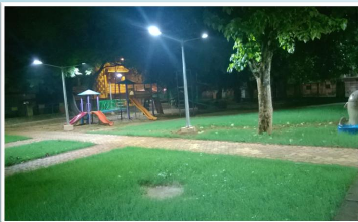
Park at 'B' Block, Koel Nagar

As a part of beautification and development of parks the of 'B' Block, Koel Nagar with LED light has been illuminated on dt.31.07.2015 with an estimated cost of Rs. 7.00 lakhs. The local residents children, youth can use this park in the evening hours.