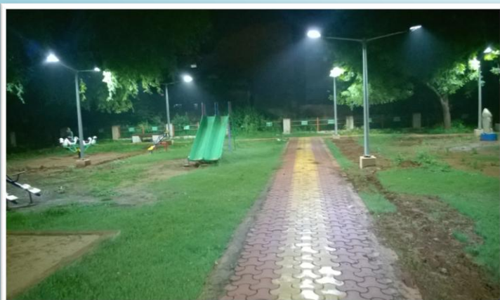
Park at 'D' Block, Koel Nagar

As a part of beautification and development of parks the of 'B' Block, Koel Nagar with LED light has been illuminated on dt.31.07.2015 with an estimated cost of Rs. 7.00 lakhs. The local residents children, youth can use this park in the evening hours.